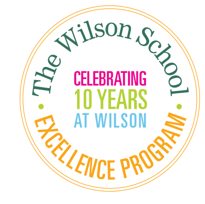
2017 Visiting Artist: Central Print Studo