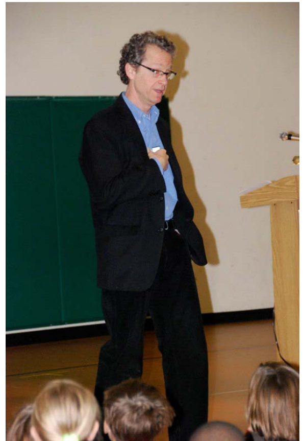
Author, Ridley Pearson, 2010